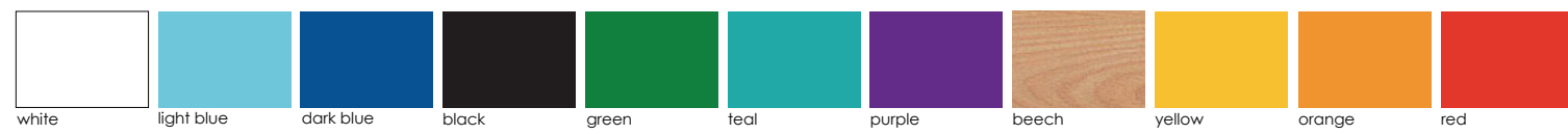
exhibit systems ●●●● creative solutions for any event

PO Box 709, Brookvale 2100 p: +61 2 9982 5511 | f: +61 2 9982 9899 www.exhibitsystems.com.au